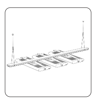
HMS Hanging Kit

Great for mounting multiple lights on one rail across your tank.