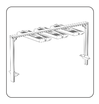
Edge Multi Mount

The Hydra® Flex Arm is the simplest and easiest Edge 44HD